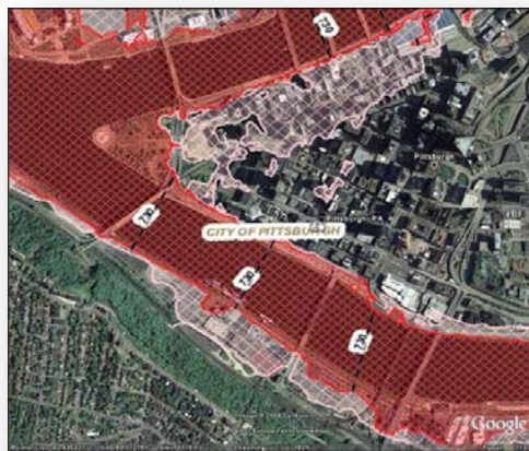
Digital Flood Insurance Rate Map.