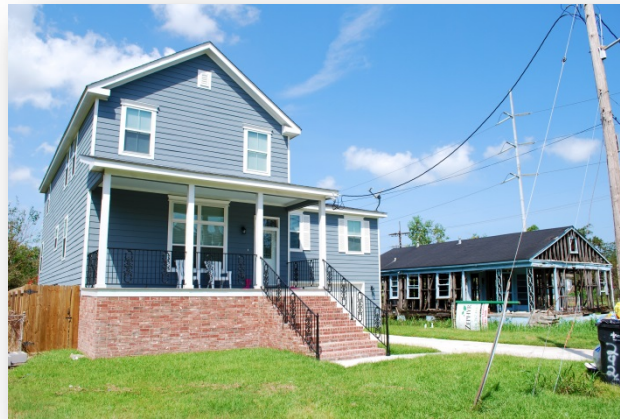
Louisiana home raised above base flood elevation. FEMA photo.