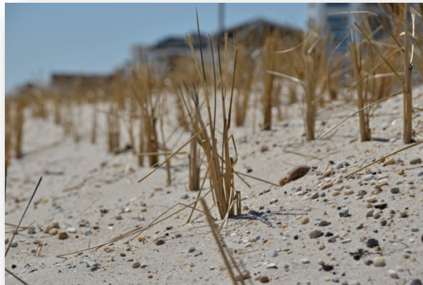
Dune grass stabilizes sand dune repaired after Hurricane Sandy in New Jersey. Dunes are a vital first-line of defense against coastal storms and flooding.