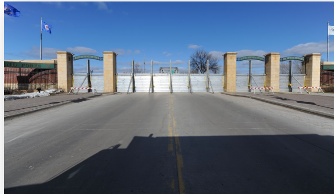
Floodwall in Grand Forks, North Dakota.