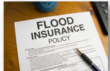
Flood Insurance Policy image. FEMA image.