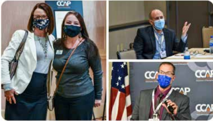
From CCAP's official Twitter page @PACountiesGR