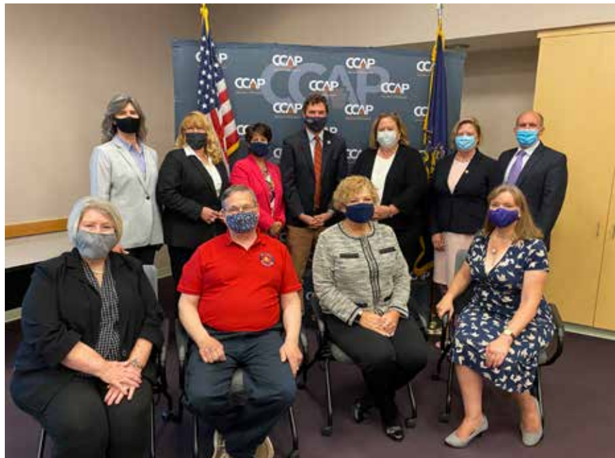
2021 Center for Excellence in County Leadership (CEL) graduates