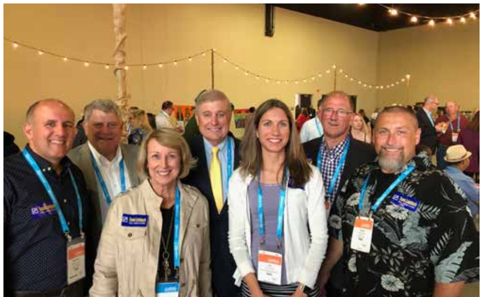
Pennsylvania delegates at the NACo 2021 Annual Conference