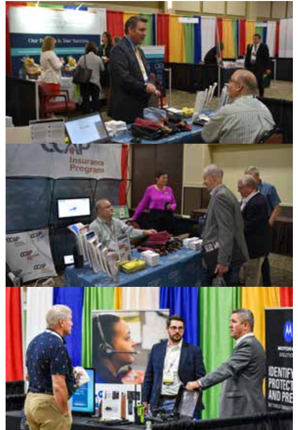
2021 Annual Conference Exhibit pictures