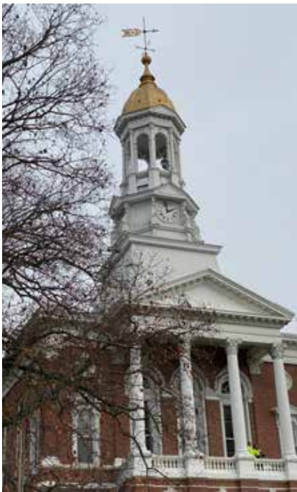
Junia County Courthouse.