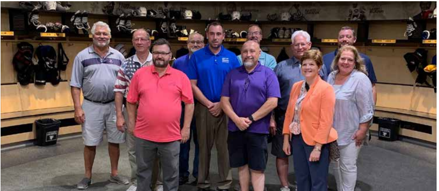
CCAP Board Retreat