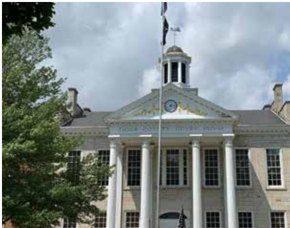
Tioga County Courthouse

newly elected legislators in the 2021-2022 legislative session.